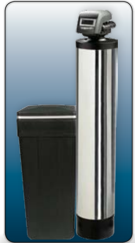
Ultramax Model UM-8150