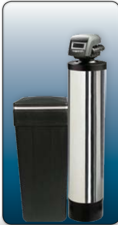
Ultramax Model UM-8100

This Goldline RO has been tested and certified by WQA against NSF/ANSI 58 for the specific performance claims verified and substantiated by test data.