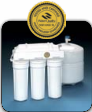
Goldline RO (#GOLDLINE 50)

Our Reverse Osmosis drinking water systems give you unbelievable quality water at an affordable price.