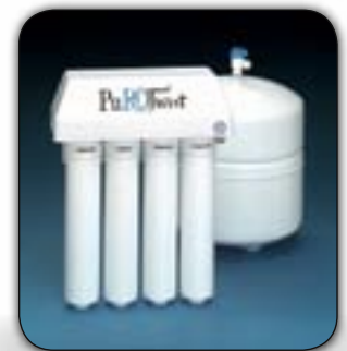
PuroTwist RO (#PT-4000)

Bottled-Water Quality for Taste, Health and Peace-of-Mind