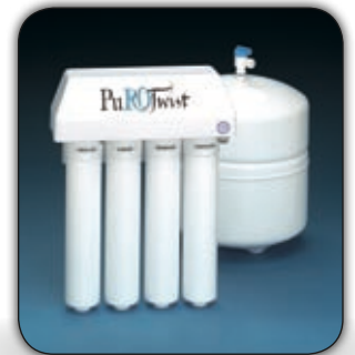
PuROtwist RO (#PT-4000)

Bottled-Water Quality for Taste, Health and Peace-of-Mind