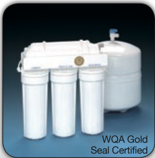
Goldline RO (#GOLDLINE 50)

Backwashing filters automatically deliver clean, clear water by removing iron, sulfur, chlorine, tastes, odors, tannins, nitrates, arsenic and many other contaminants.